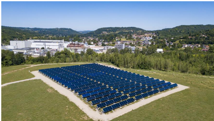
Solar thermal plant of CONDAT (Nouvelle Aquitaine, France)